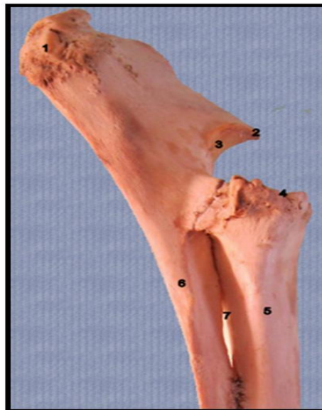
Figure 1: Proximal extremity of right radius and ulna

In the present study, radius and ulna were fused through the entire length except for two inter-osseous spaces, namely, proximal and distal inter-osseous spaces similar to the observation of [11] in Moschida, most Antelopes, sheep, Elk, Rein-deer, Fallow-deer, [14] and [12] in ox, [1] in ruminants, [5] in sheep, [13] in Black Bengal goat and [3] in Antelope. These findings are inconsistent with the findings of [5] and [4] in horse where the ulna was fused at the proximal third of the radius and presented only proximal inter-osseous space and [10] in dog, where two bones attached to each other only at their ends. (Figure1)