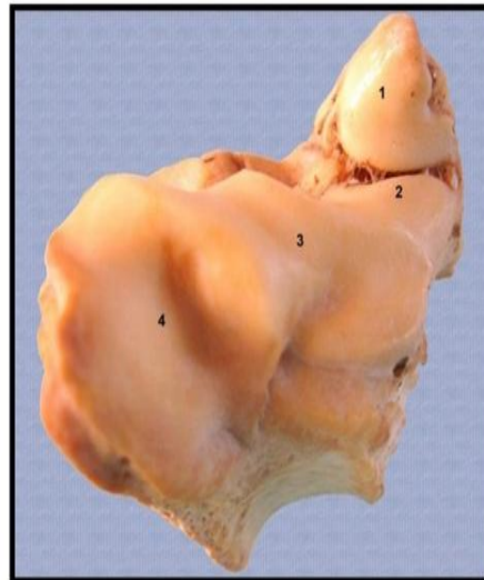
Figure 3: Distal extremity of right radius and ulna 1. Styloid process, 2. Facet for ulnar carpal, 3. Facet for intermediate carpal, 4. Facet for radial carpal

The Proximal extremity was irregularly oval in outline with its long axis being medio-lateral in direction similar to the reports of [10] in dog, on the contrary [16] reported that it was triangular in outline in elephant. The nutrient foramen in the present study was found variably between lateral border and lateral margin of proximal inter-osseous space, which is more or less similar to the observations of [12] in ox, however, it is located slightly above the middle of the caudal surface of the radius in dog [10] Distal extremity was thicker and larger than the proximal one, which is similar to the observations of [10] in dog. On the distal end, oblique articular surface was presented, which is similar to the findings of [2] in pig, [14] and [12] in ox. It consisted of three articular areas for first three carpal bones of the proximal row. The medial one was the largest, while the middle one is intermediate in size. The lateral one was the smallest, which is similar to horse. [5] On the contrary, the middle one is the largest in dog. [10]