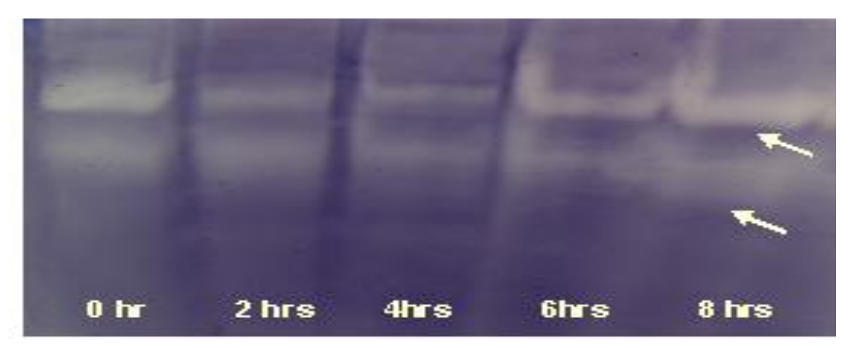
Figure 4: Effect of NaCl stress on Superoxide Dismutase

Figure 3-4: Effect of NaCl stress on Superoxide Dismutase activity in Withania somnifera