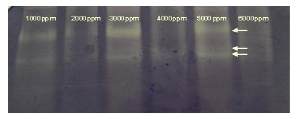
Figure 3: Effect of NaCl concentration on Superoxide Dismutase